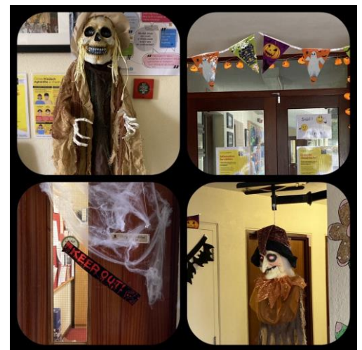
Míle buíochas le Cairde na Scoile as ucht an scoil a mhaisiú i rith na seachtaine.

Cabhraíonn Cairde go mór leis an eispeireas scoile iomlán do dhaltáí, tuismitheoirí agus múinteoirí. I gnáth bliain scoile, gan COVID, cabhraíonn Cairde imeachtaí mar Céiliúradh Oíche Shamhna, Céiliúradh na Nollag & Cuairt Dhaidí na Nollag, An Chéad Chomaoineach & Coineartú, An Margadh Leabhair agus imeachtaí tiomsaithe airgid a eagrú. Ba iontach an rud é dá smaoineofa a bheith i do bhall de Choiste Cairde na Scoile. Cairde na Scoile - our Parents' Association - is a key part of the success of Gaelscoil na Ríthe. All parents and guardians of children attending the school are a part of Cairde but new committee members are needed. In a 'normal' school year the Cairde committee meet once a month to discuss school matters, plan and organise events for the children such as the Halloween and Christmas Celebrations, The Book Fair, First Communion & Confirmation Parties and organising various fundraising activities. We ask you to consider joining the committee, your energy, voice and ideas can make a huge difference.